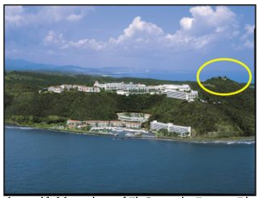
The beautiful location of FitCamp in Puerto Rico. If Lawrence's reputation in the fitness industry doesn't influence you, the location certainly will!